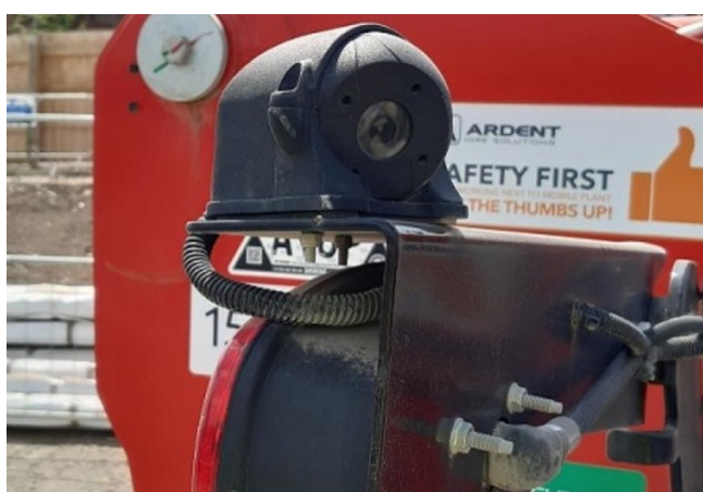
AN EXAMPLE OF GOOD PRACTICE

House builder Countryside is the first developer to demand all telehandlers on its sites feature the latest worker proximity smart warning cameras.